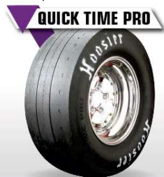
QUICK TIME PRO

WARNING: DOT labeled Hoosier Racing Tires meet Department of Transportation requirements for making and performance only and are NOT INTENDED FOR HIGHWAY USE . It is unsafe to operate any Hoosier Racing Tire including DOT tires on public roads. The prohibited use of Hoosier Racing tires on public roadways may result in loss of traction, unexpected loss of vehicle control, or sudden loss of tire pressure, resulting in a vehicle crash and possible SERIOUS PERSONAL INJURY OR DEATH .