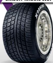
CIRCUIT RADIAL WET